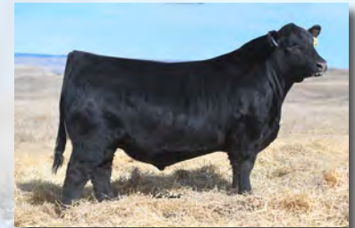
Square B Atlantis 8060

S A V Resource 1441 SCR Everelda Entense 852 Rito 707 of Ideal 3407 7075 S A V Blackcap May 4136 Sitz Alliance 6595 BT Everelda Entense 613L