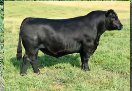
Baldrige Flagstone F411