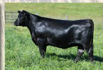
Daughters of 032