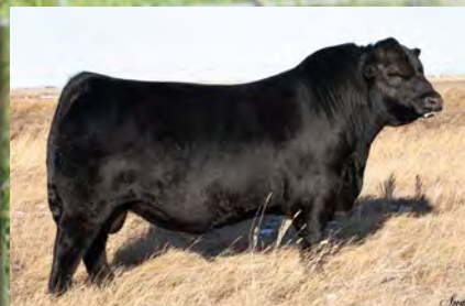
PM Executive Decision 5'17