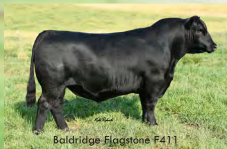
Baldrige Flagstone F411