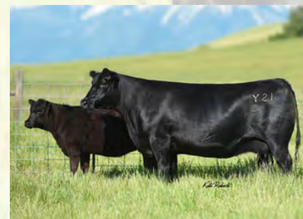
Pine Coulee Forever Lady Y21 Flush sister to Dam of A39