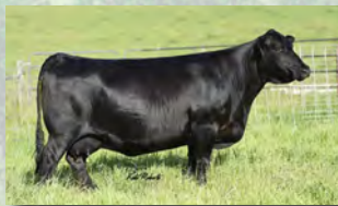
Pine Coulee Black Annie U10