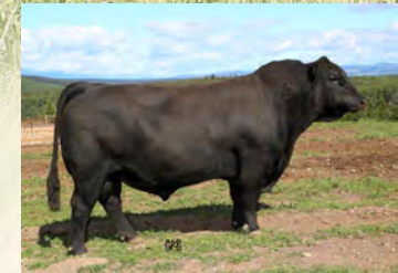
Bar-E-L Natural Law 52Y Natural Law is truly a maternal machine as you can see in the pictures of his daughters and his son, Executive Decision.