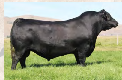
Coleman Bravo 6313