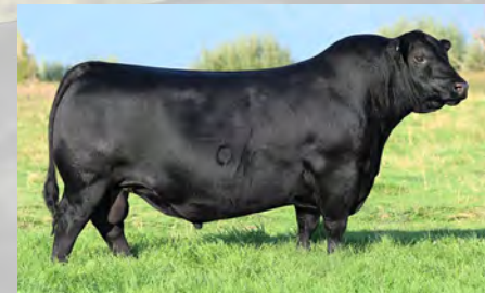
Coleman Resolve 7219

Connealy Reflection Pearl Pammy of Conanga 194 Rito 112 of 2536 Rito 616 MW Black Nellie 232