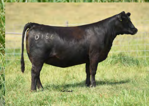
Pine Coulee Everelda D166 Natural daughter of Z58