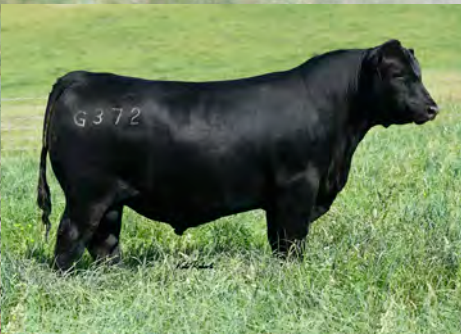
Service Sire Pine Coulee Drifter G372