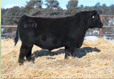
FLUSHMATE SIBS TO G1