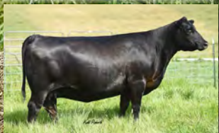
Pine Coulee Black Annie Y96