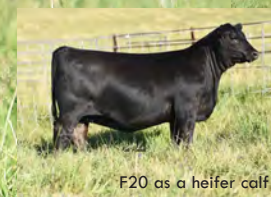
F20 as a heifer calf