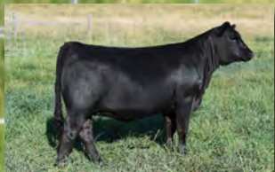
Pine Coulee Black Annie G28 Natural daughter of B87