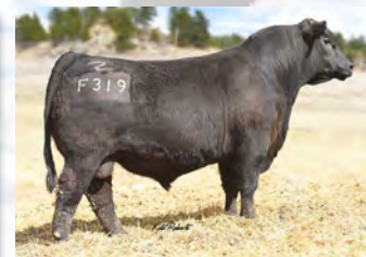
Pine Coulee Citadel F319