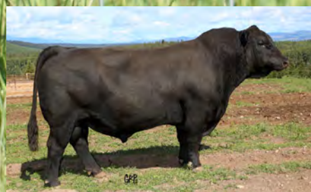
Bar-E-L Natural Law 52Y