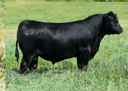
Pine Coulee Drifter G372