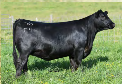
F4 - Daughter of A40