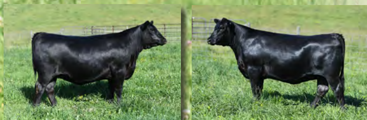
Daughters of 032