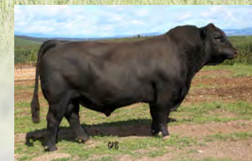
Bar-E-L Natural Law 52Y