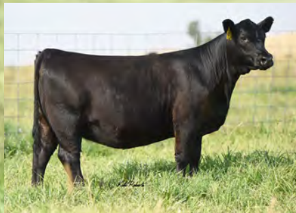
Pine Coulee Forever Lady E60