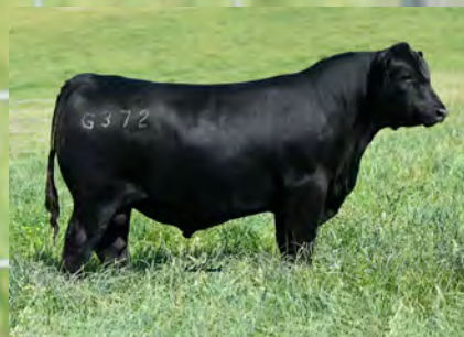
Son of X64