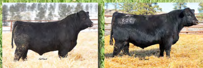
Sons of 032