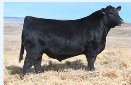
Square B Atlantis 8060

Connealy Reflection Pearl Pammy of Conanga 194 Rito 112 of 2536 Rito 616 MW Black Nellie 232