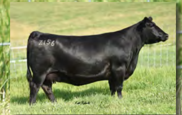
Pine Coulee Everelda Z156