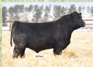
Sons of 032