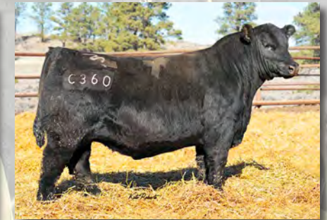
Pine Coulee Advance C360 Son of A39