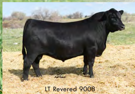
LT Revered 9008