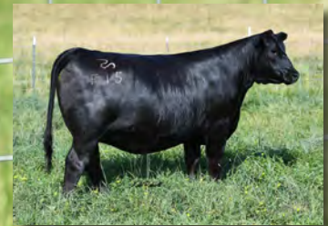
Pine Coulee Ever Entense F15