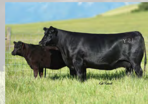
Pine Coulee Forever Lady Y21 Flush sister to Z805