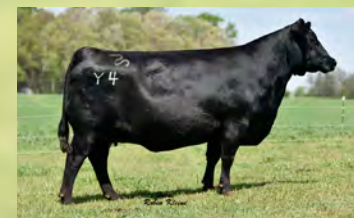
Pine Coulee Lucy Y4 - Flush sister, owned by Sandford Ranch, TX