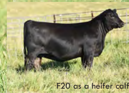
F20 as a heifer calf