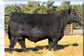
Pine Coulee Impressive C363