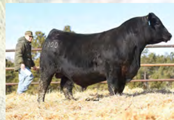
Pine Coulee Cattleman F300