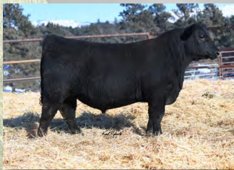
Pine Coulee Bravo G390 Son of Z805