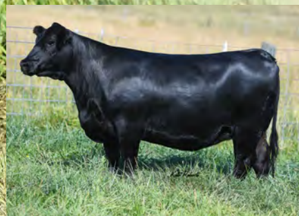
Pine Coulee Forever Lady F33