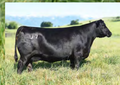
Pine Coulee Black Annie U7 - Maternal sister to D38