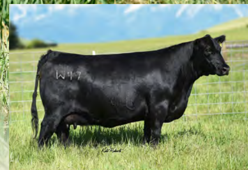
Pine Coulee Lass W47- Dam