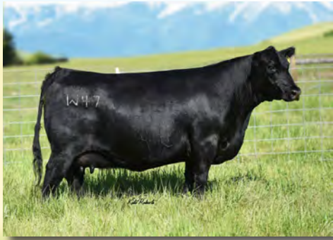
Pine Coulee Lass W47