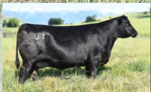
Pine Coulee Black Annie U7