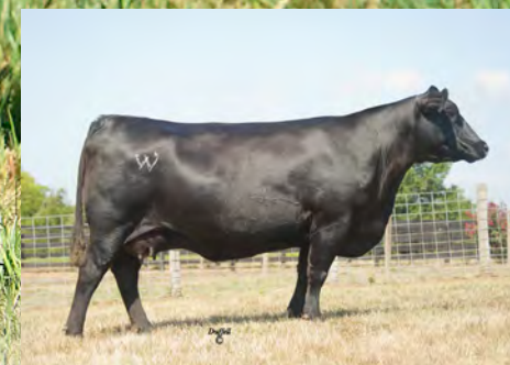
SH Lady 7321 939- Dam